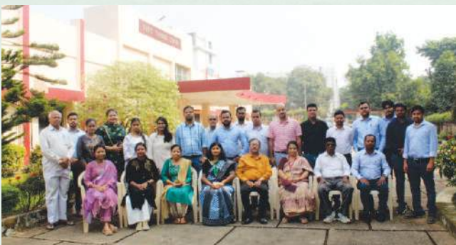
A one day training program on “Cyber Security” was conducted by National Informatic Centre, Bhubaneswar on 14 th November, 2024.