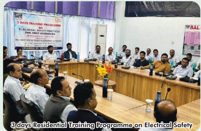
3 days Residential Training Programme on Electrical Safety

In association with REC Institute of Power Management and Training (RECIPMT), Hyderabad, 03 days residential training programme on Electrical Safety Practices was conducted at BHEP from 6 th to 8 th January 2025 and 9 th to 11 th January 2025 respectively. Total 60 nos. of executives from different units of OHPC alongwith the technical executives of BHEP attended the training programme in two batches.