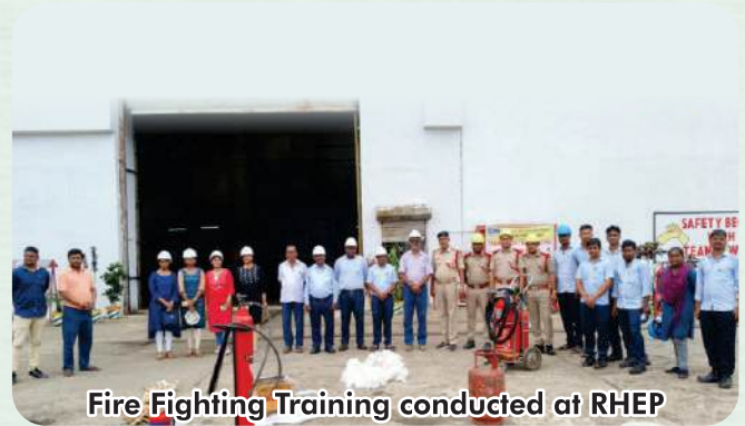
Fire Fighting Training conducted at RHEP

As part of emergency preparedness, a training programme on firefighting was organised at RHEP on 23 rd August 2024. To create awareness among the employees towards ignition, types, causes of fire and practical measures to tackle the fire, this training programme was conducted by Fire Officers & staffs of fire station, Kaniha in the Power House premises of RHEP.