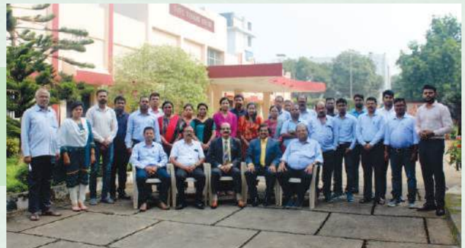
Two days Training Program on “Critical Thinking, Analytical Thinking & Creative Problem Solving” was conducted by NIPM, Utkal Chapter, Bhubaneswar on 7 th & 8 th November, 2024.