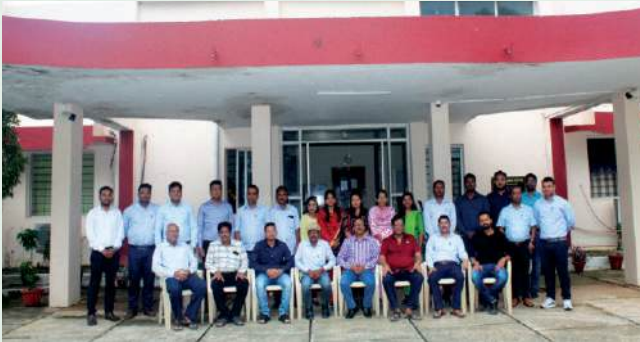
A one day training program on “RTI Act” was conducted by M/s. Citizen Information & Legal Aid Center, Cuttack on 30 th August, 2024.