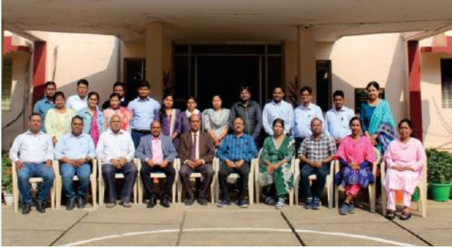
Two days Training Program on “(A) Finance for Non-finance Executives” and “Contract Management” was conducted by M/s. OMM HR Services & Solutions, Bhubaneswar on 12 th & 13 th December, 2024.