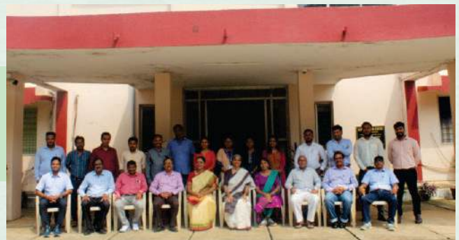
Two days Training Program on “Anubhav-Creating Thinking Self-development and Vikash-Enhancing Performance through personal effectiveness” was conducted by Manav Adhyayan Kendra Pvt. Ltd, BBSR on 4 th & 5 th October, 2024.