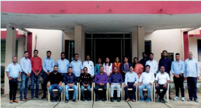
A one day training program on “GST” was conducted by M/s. Current Creators Private Limited, Bhubaneswar on 31 st August, 2024.