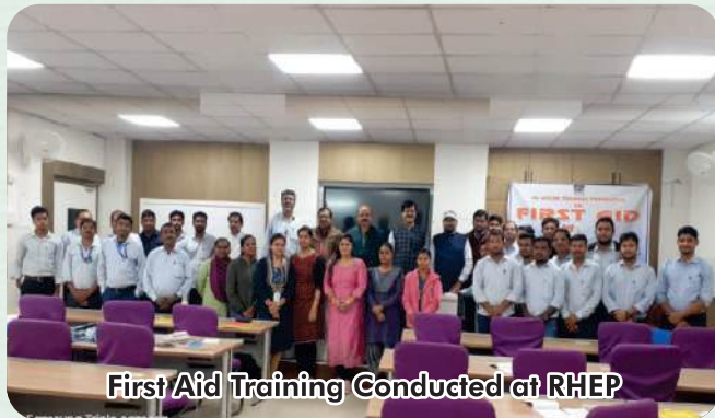
First Aid Training Conducted at RHEP

RHEP organised three days training programme on First Aid from 28 th to 30 th November 2024 as part of its commitment to workplace safety. The training programme was conducted by St. John Ambulance Association of India at Power House premises to preserve life, prevent deterioration and promote recovery. Thirty nos. of employees of RHEP had participated in this training programme.