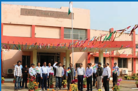
OHPC Training Centre, Bhubaneswar