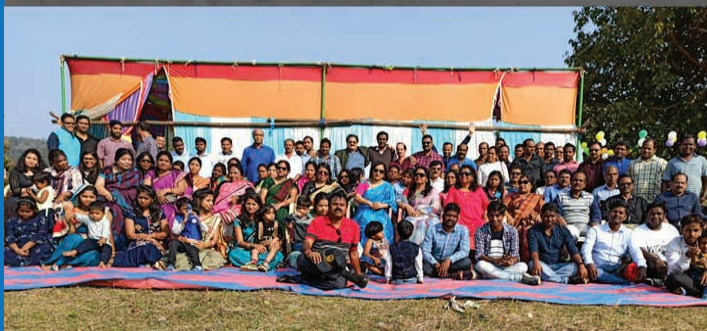
Staff Picnic with Family Members organised at Kadalipala by RHEP, Rengali