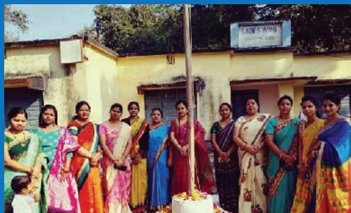
Ladies Wing, RHEP, Rengali