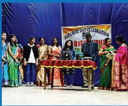
Prize distribution during the Cultural Programme at RHEP, Rengali