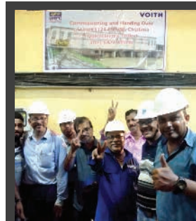
Commissioning of Unit-3

After commissioning and trial run, Unit-3 of CHEP, Chiplima was in commercial operation since 21 st January, 2020 and the Unit was provisionally taken over with effect from 18 th May, 2020. The Unit will be finally taken over after completion of all pending works with successful Performance Guarantee Test.