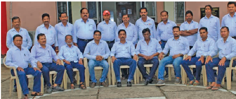
174 th TNE Refresher Training Program from 10 th February, 2020 to 29 th February, 2020 conducted by the internal trainers.