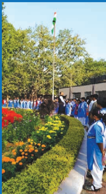
Office of the GM, CHEP, Chiplima