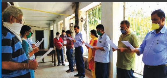
Oath taking on the occasion of Anti-Terrorism Day on 21 st May, 2020 at CHEP, Chiplima