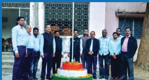
Officers' Club, CHEP, Chiplima