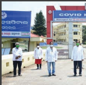
COVID Hospital at Balasore

Under CSR activities, OHPC has extended its support to Government of Odisha as a Corporate Partner by providing necessary financial assistance for two COVID-19 Hospitals in the Balasore and Gajapati districts. The COVID hospital in Gajapati district has 112 beds including 10 beds of ICU and the hospital in Balasore has 120 beds including 8 HDU beds and 12 ICU beds.