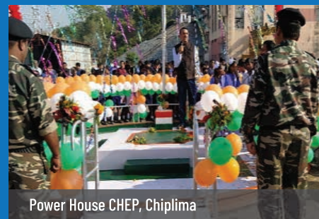
Power House CHEP, Chiplima