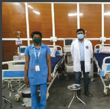
COVID Care Centre at Gajapati