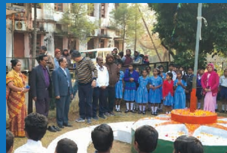
Admin. Building, RHEP, Rengali