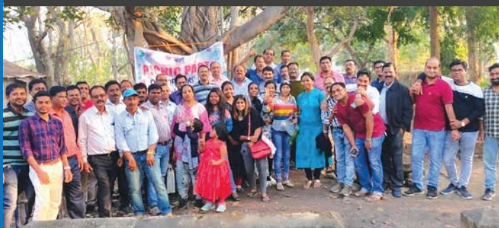
Joint family Picnic of HHEP, Burla & CHEP, Chiplima at Head Regulator, Chiplima