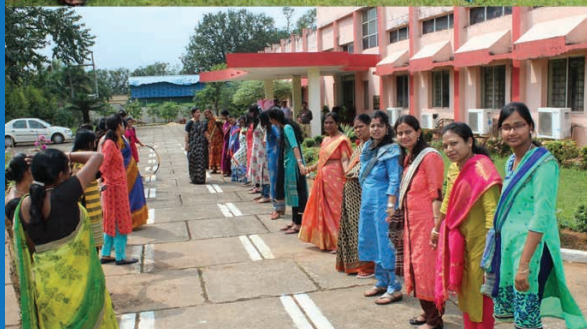
At Training Centre, Bhubaneswar