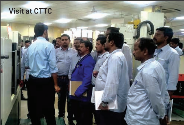
Visit at CTTC