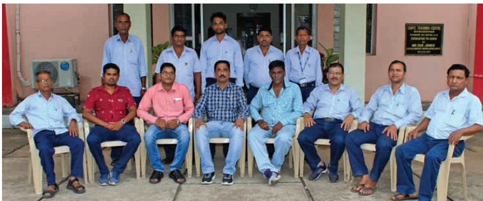
175 th TNE Refresher Training Program from 11 th March, 2020 to 21 th March, 2020 conducted by the internal trainers.