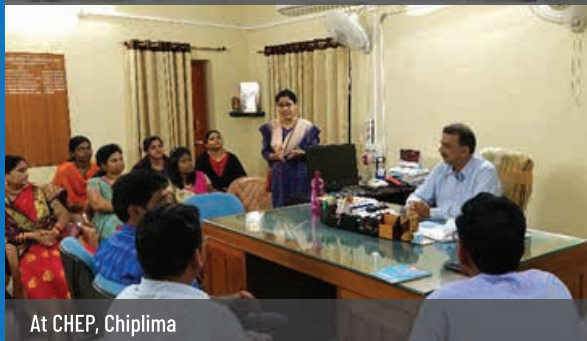
At CHEP, Chiplima