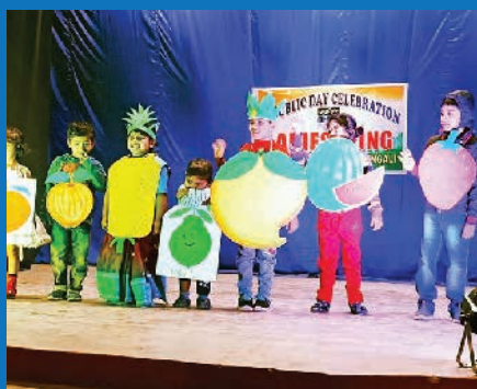
Performance by kids at RHEP, Rengali