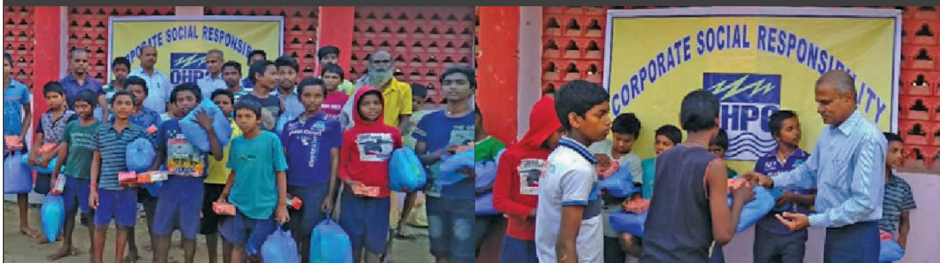
Blanket Distribution among the children at Kalpataru Seva & Shikshyashram, Larpank, Hiraikud, Sambalpur