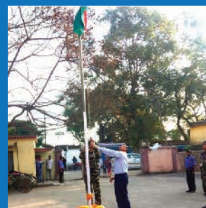
SGM (EL), HHEP, Burla