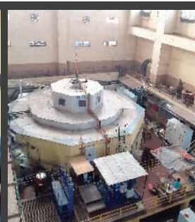
Unit-3 after renovation and modernization