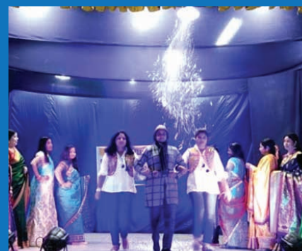
Ramp show by Ladies Wing of RHEP, Rengali