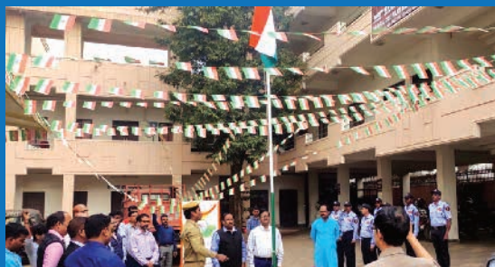
Corporate Office, Bhubaneswar